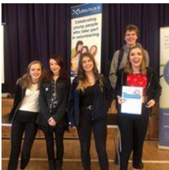
Highland wide survey of Young People Autumn 2018