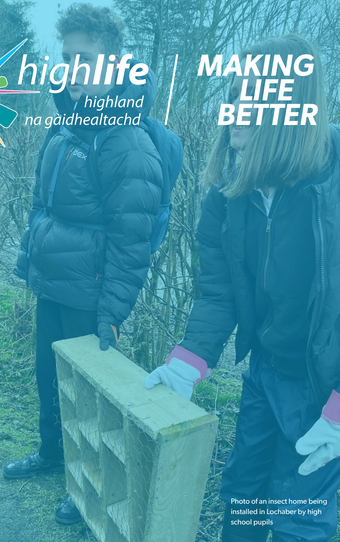
Photo of an insect home being installed in Lochaber by high school pupils