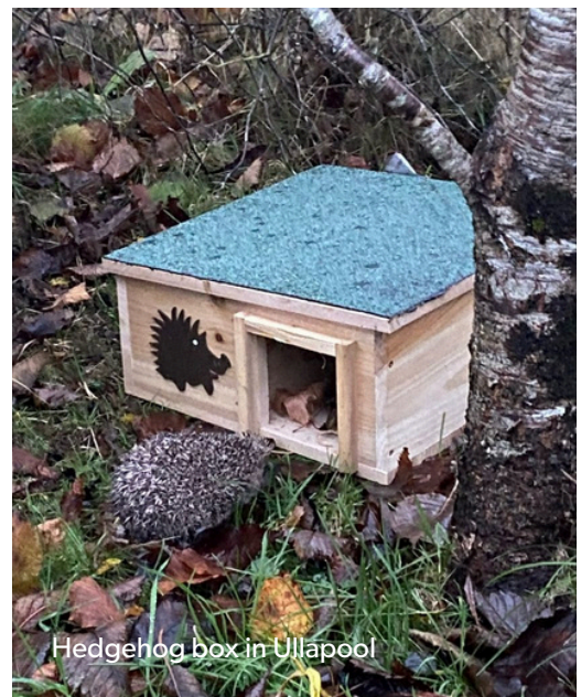
Hedgehog box in Ullapool

At the time of reporting, approximately 50% of boxes have been deployed across the Highlands, with installation ongoing across a range of suitable habitats including community spaces, school grounds and woodland edges.