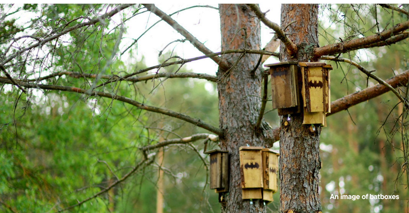
An image of batboxes

A key principle was participation, with community groups, schools and volunteers actively involved in building and placing the boxes. This approach linked practical conservation action with local engagement, helping to build skills, awareness and a stronger connection to the natural environment.