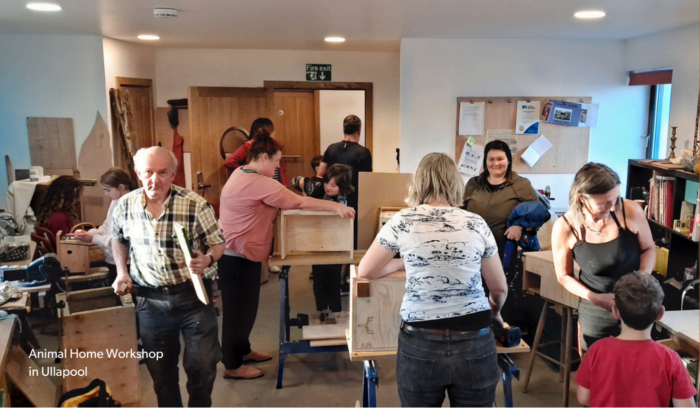
Animal Home Workshop in Ullapool