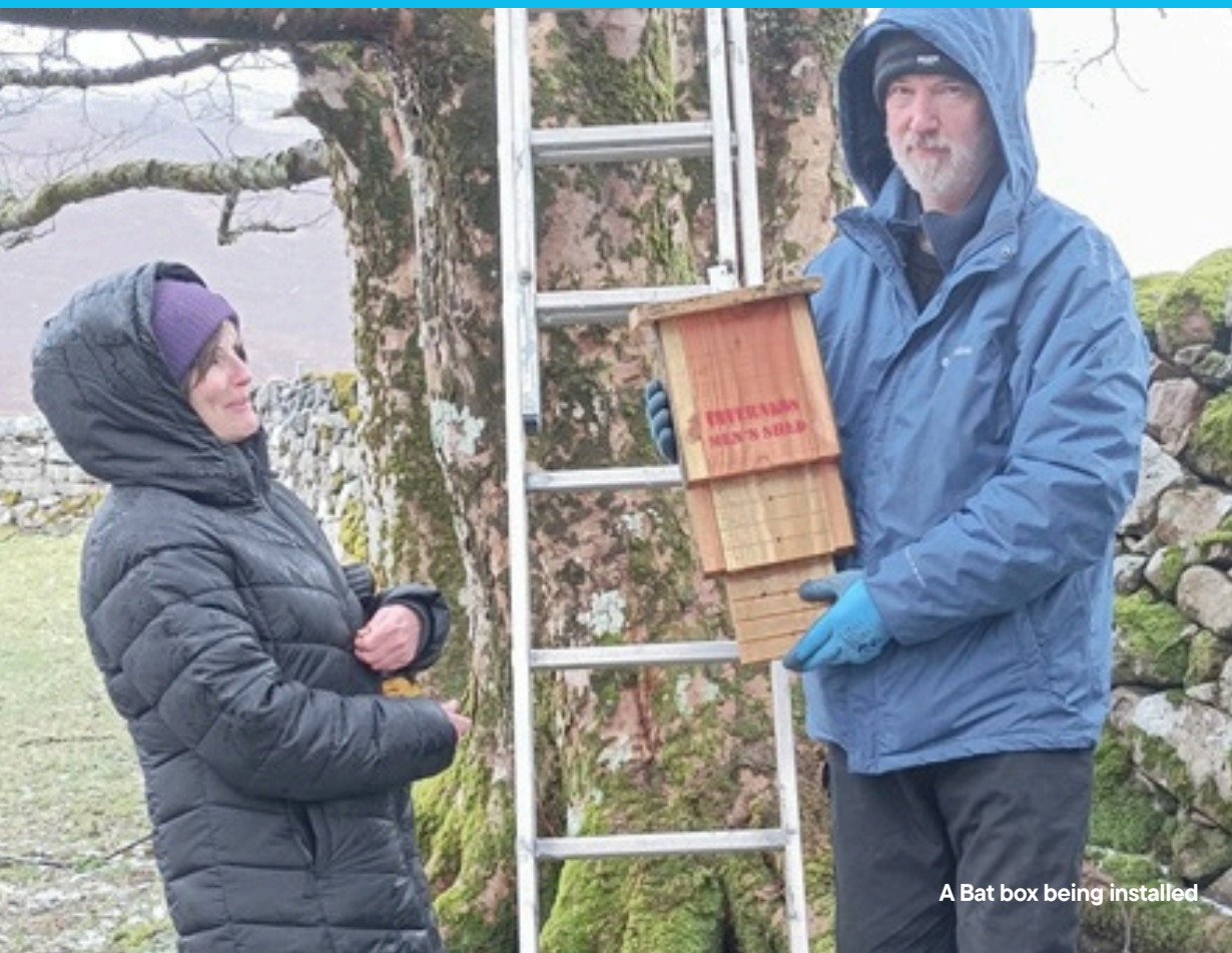
A Bat box being installed