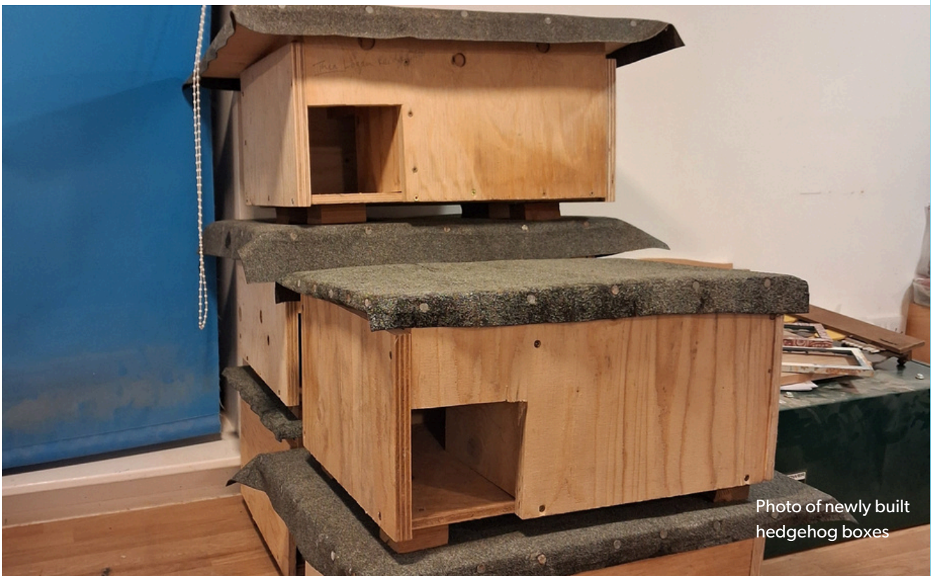
Photo of newly built hedgehog boxes

As installation continues and the boxes begin to be used by wildlife, the longer-term impact will become clearer, building on the strong foundations already established.