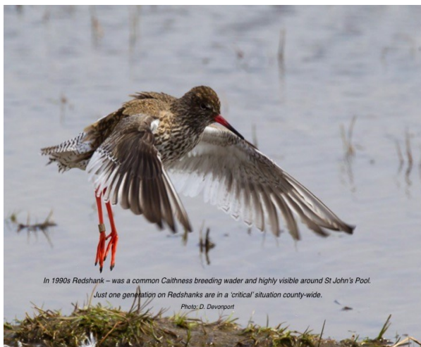
In 1990s Redshank – was a common Caithness breeding wader and highly visible around St John's Pool. Just one generation on Redshanks are in a 'critical' situation county-wide.

https://www.facebook.com/SJPbirdphotography/