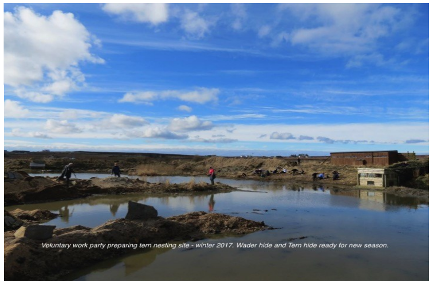
Voluntary work party preparing tern nesting site - winter 2017. Wader hide and Tern hide ready for new season.

St John's Pool is a private reserve but open daily to the public.