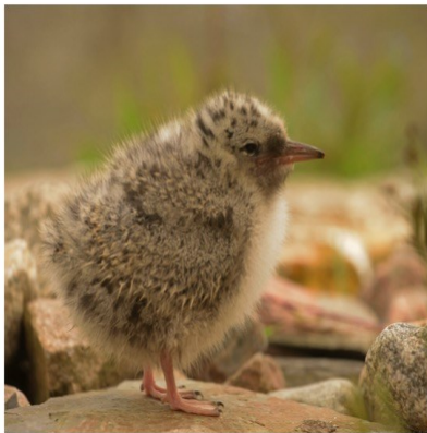
Arctic tern chicks just inches away. Irresistible!

The ever-expanding archive of high quality images like those below, is testament to the attraction of the site to a wide variety of birds.