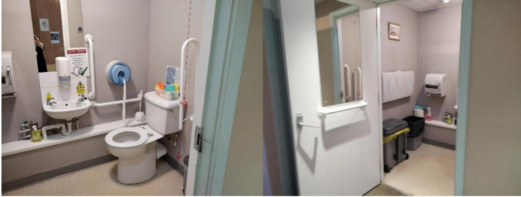
Disabled toilet (inc. baby change unit)