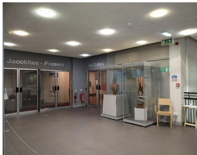
1 st Floor Foyer – access to Museum and Art Galleries