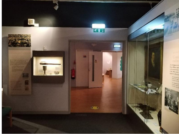
Entrance to Small Art Gallery, and to Main Art Gallery, from Museum