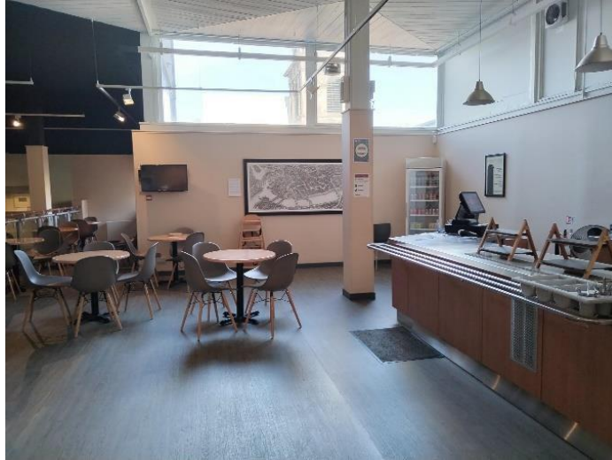
IMAG Coffee Shop – accessed via the Gift Shop