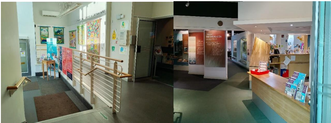
Entrance to reception from Community Gallery (with low counter)