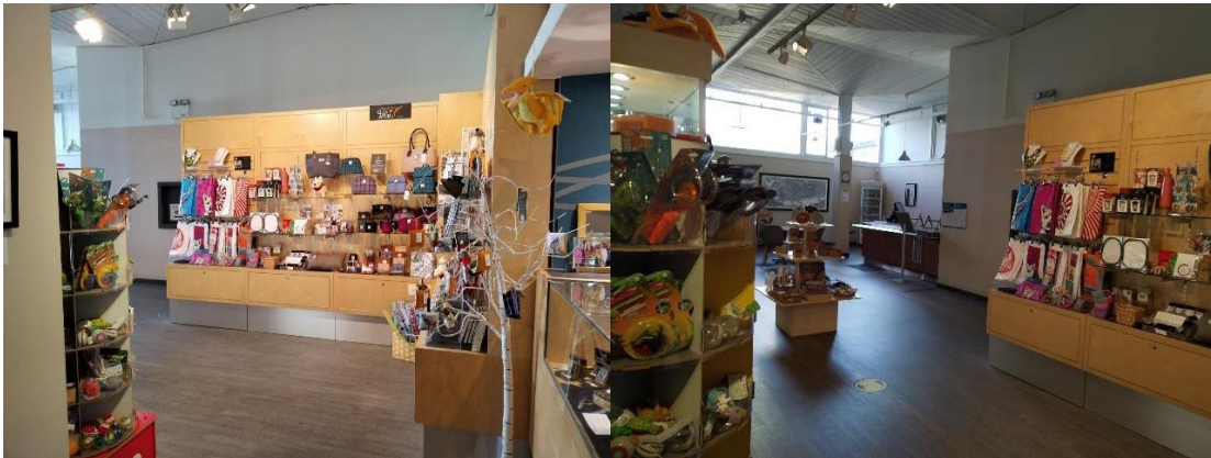
Gift Shop – accessible from Reception. The café and toilets are also accessible from this point.