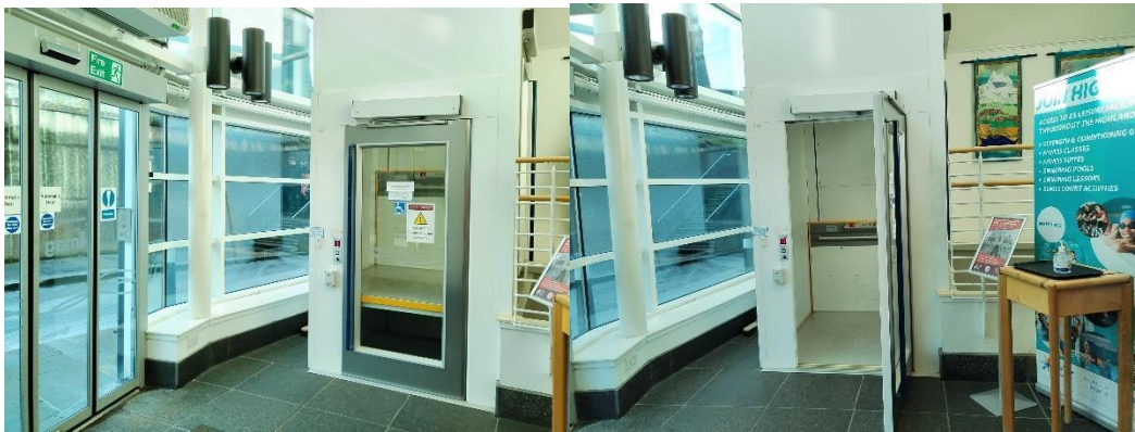
Passenger Lift from Front Door – access to Ground Floor