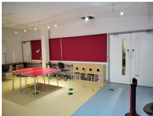
“Room to Discover” – accessed from ground floor exhibition space