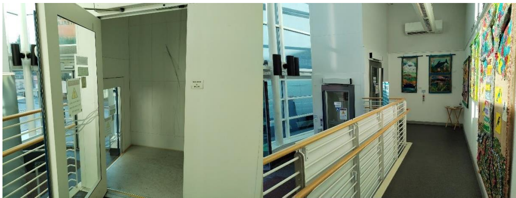
Passenger Lift exits to Community Gallery