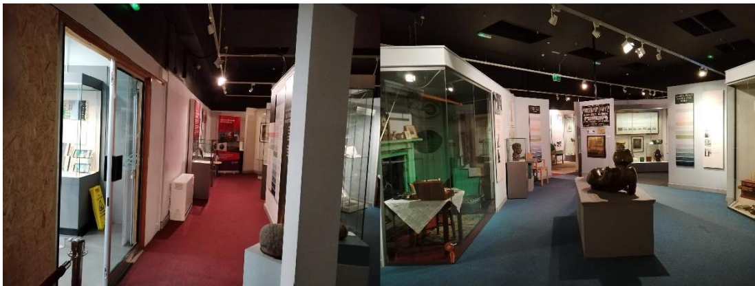
First floor Museum space