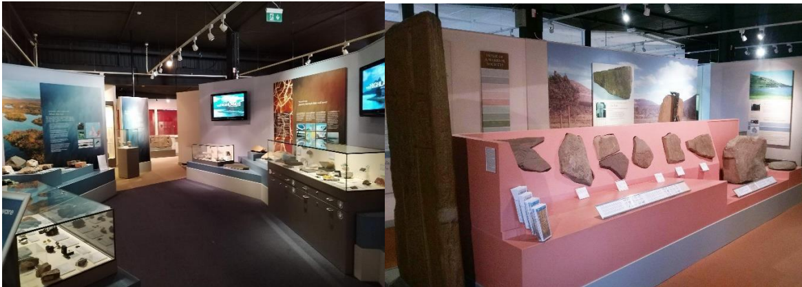
Main ground floor exhibition space