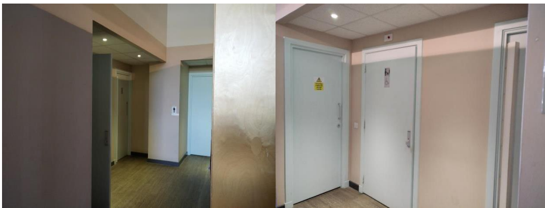
Entrance to disabled toilet – accessed from café/shop