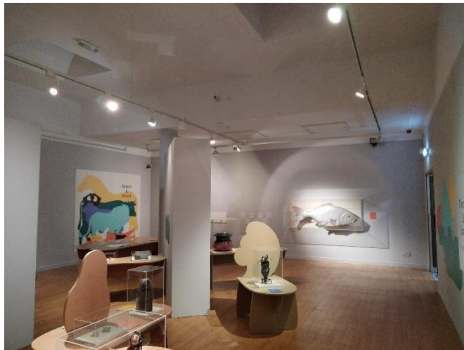
Main Art Gallery - Exit to First Floor Foyer (and Passenger Lift)