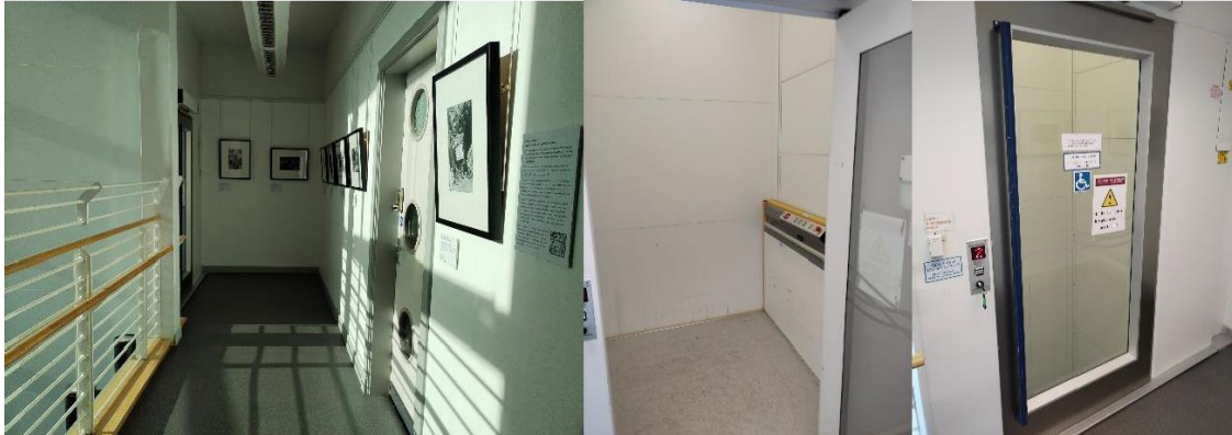
Access to first floor via Passenger Lift