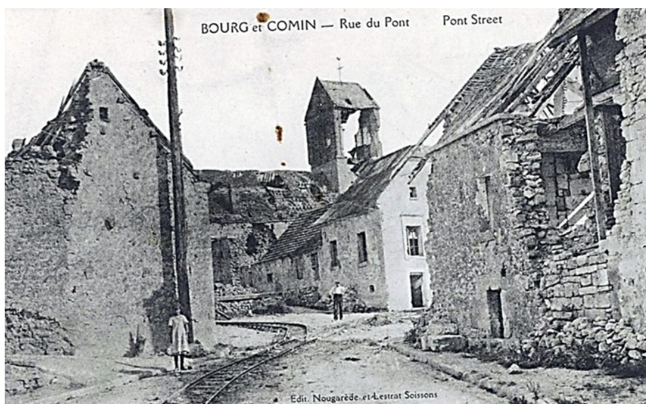
Postcard of Rue de Pont, Bourg et Comin, Northern France, c.1915

Educated at Eton College and Sandhurst; he rose to the rank of Captain in the service of the 1st Battalion, Queen's Own Cameron Highlanders. As part of the British Expeditionary Force, he was among some of the first British soldiers to fight in the First World War. Stationed at Bourg-et-Comin in Northern France; he fought in the first Battle of the Aisne in September 1914.