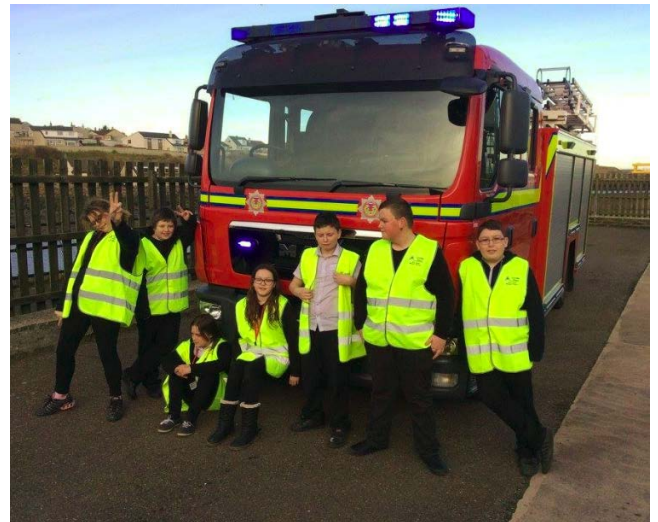
Key facts and stats

The Wick Youth Development team has worked with 128 individual youngsters aged between 11 and 25 amounting to 4,050 meaningful contacts